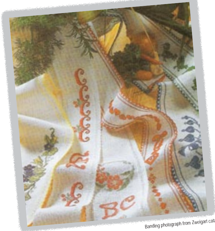
Banding photograph from Zweigart catalog